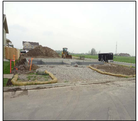
Fig. 1: Compliant residential job site