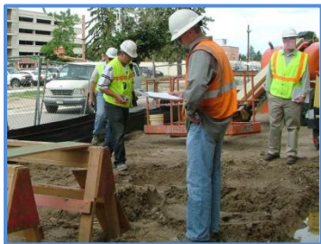
Student Training Manual provided for all participants.